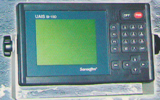
SI-10D KDU (Keyboard & Display Unit)