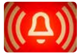
Off course alarm