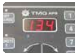
3 heading input options