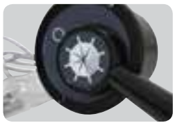
JOG lever input