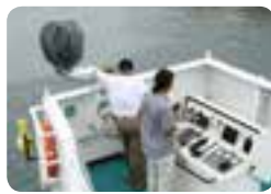
Up to two remote steering positions