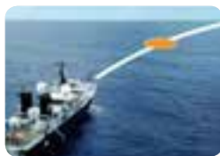
Waypoint Steering (when interfaced with GPS plotter)