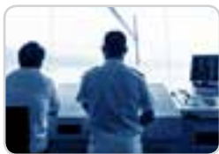
Timer adjustable or fixed for use as a commercial watch alarm