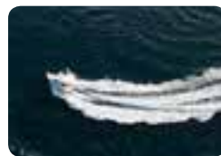
Rate of turn adjustment