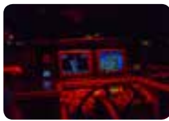
Luminescent front panel for ease of use at night