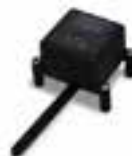
Rudder Feedback Unit (Heavy Duty)